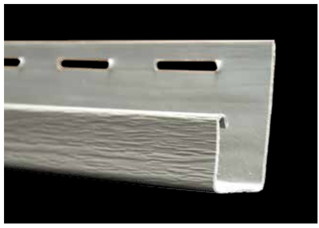
J-CHANNEL For inside corners and gables. Available in 10.5' length.

Commonly used for inside corners and in gable applications, Grayne j-channel is available in solid colors developed to match Grayne Engineered Composite Shingles.