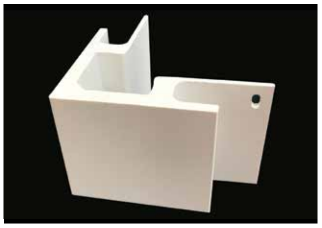
OUTSIDE CORNER WITH NAILING FLANGE Available in nominal 4" & 6" widths

Moisture-resistant cellular PVC provides maximum water management when installed correctly. An integrated nailing flange forms a 3/4" j-channel for faster, easier installation of Grayne Engineered Composite Shingles. You can choose to stick with their brilliant white paint color or paint them to match any surrounding elements.