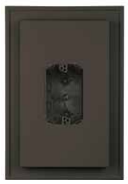
JUMBO UL MOUNT A centered, UL-listed 18 cu. in. outlet box