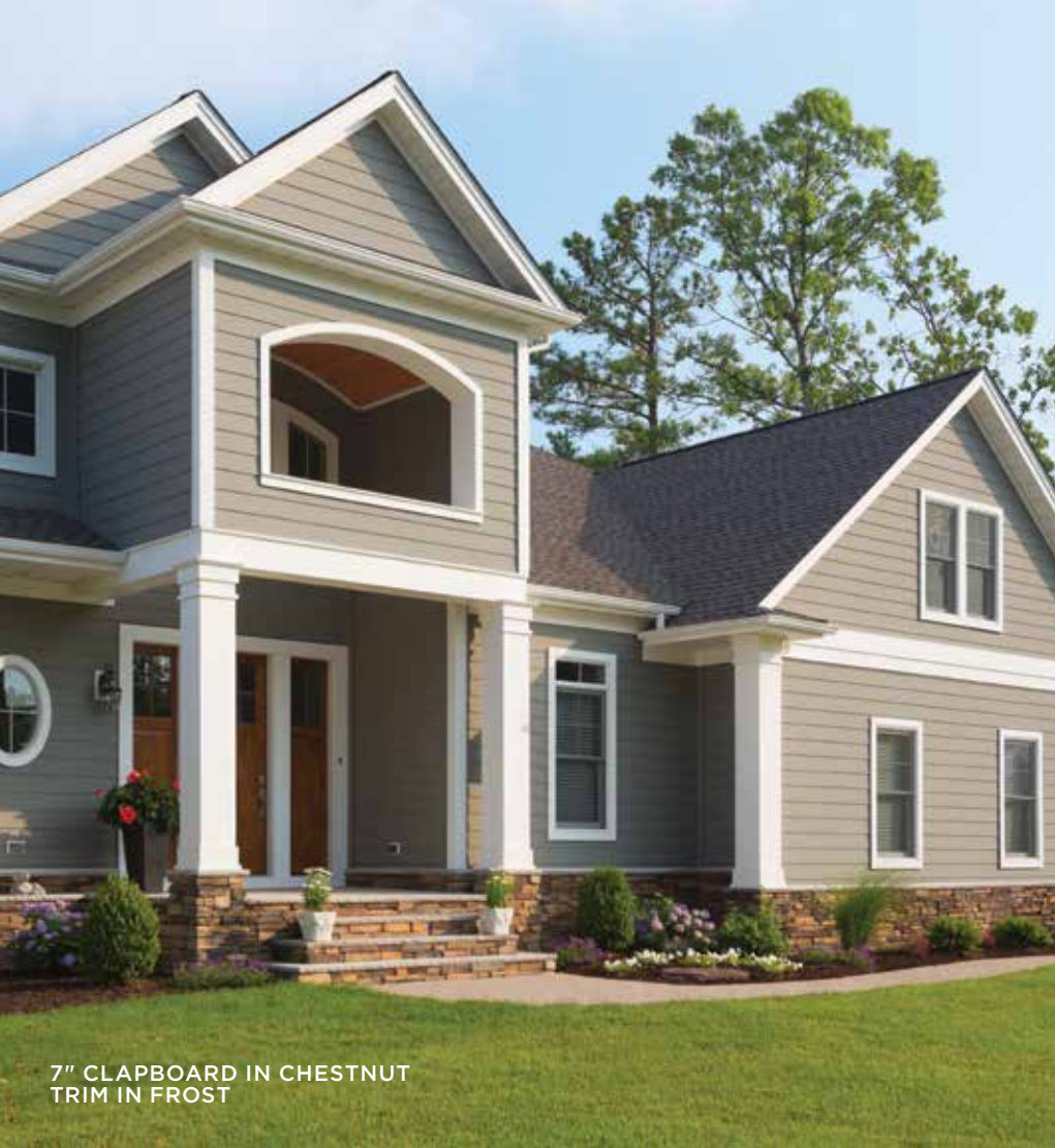
7" CLAPBOARD IN CHESTNUT TRIM IN FROST