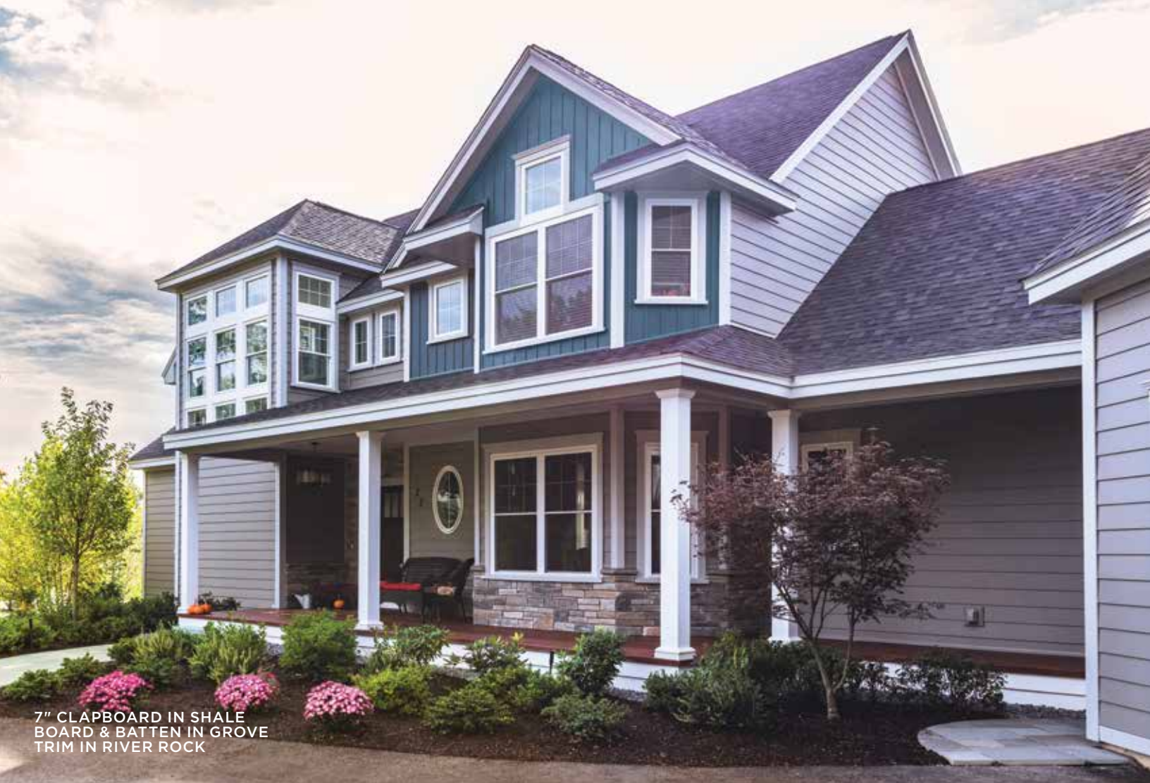
7" CLAPBOARD IN SHALE BOARD & BATTEN IN GROVE TRIM IN RIVER ROCK