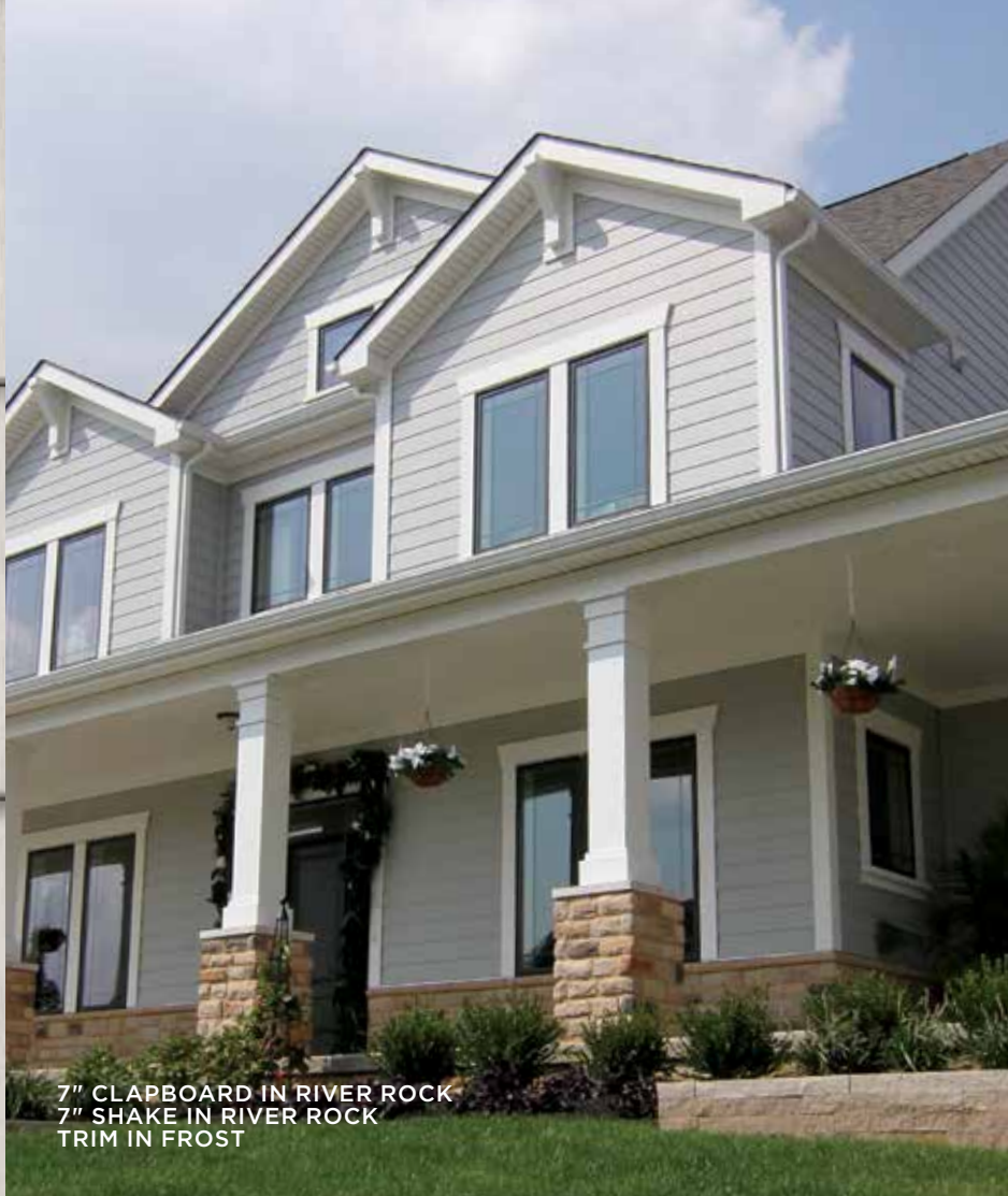
7" CLAPBOARD IN RIVER ROCK 7" SHAKE IN RIVER ROCK TRIM IN FROST

Presenting our fade-defying, character-building colors.