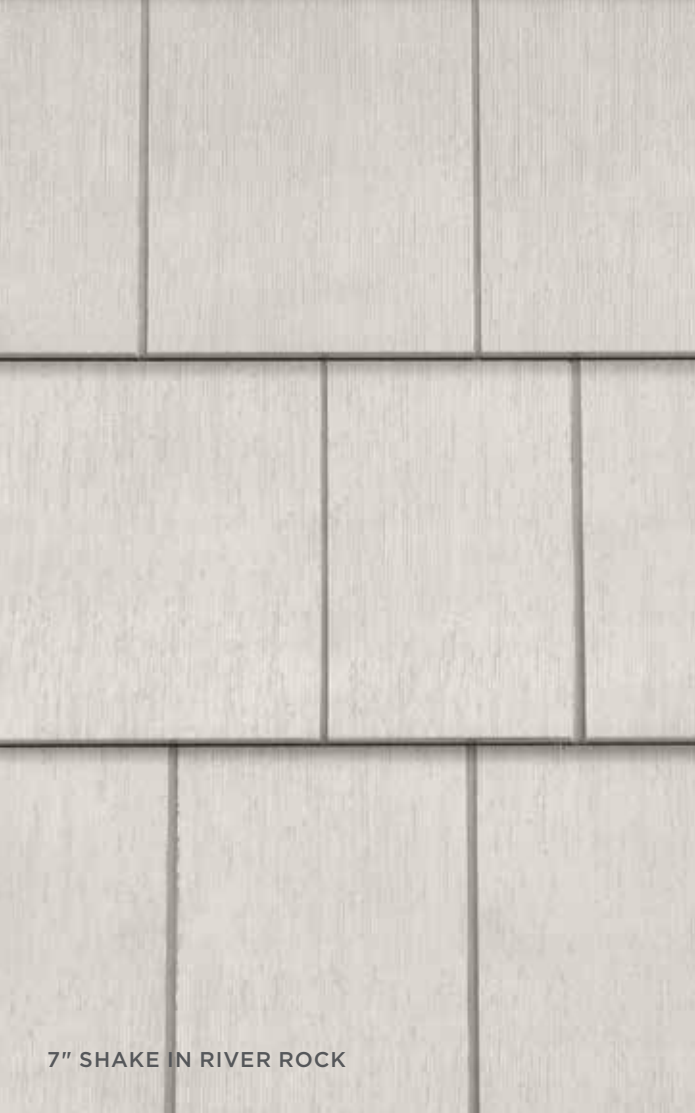
7" SHAKE IN RIVER ROCK