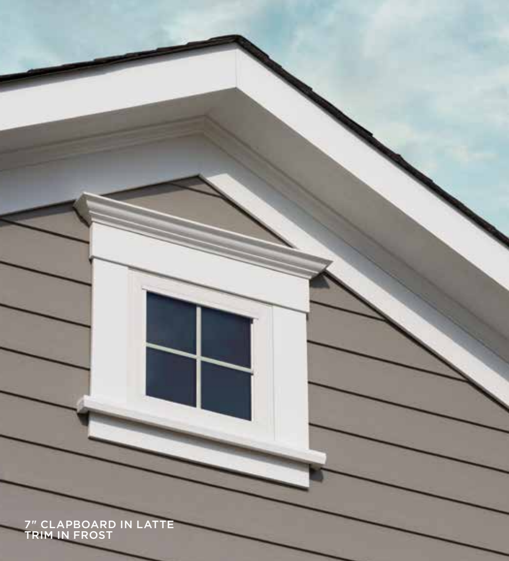
7" CLAPBOARD IN LATTE TRIM IN FROST