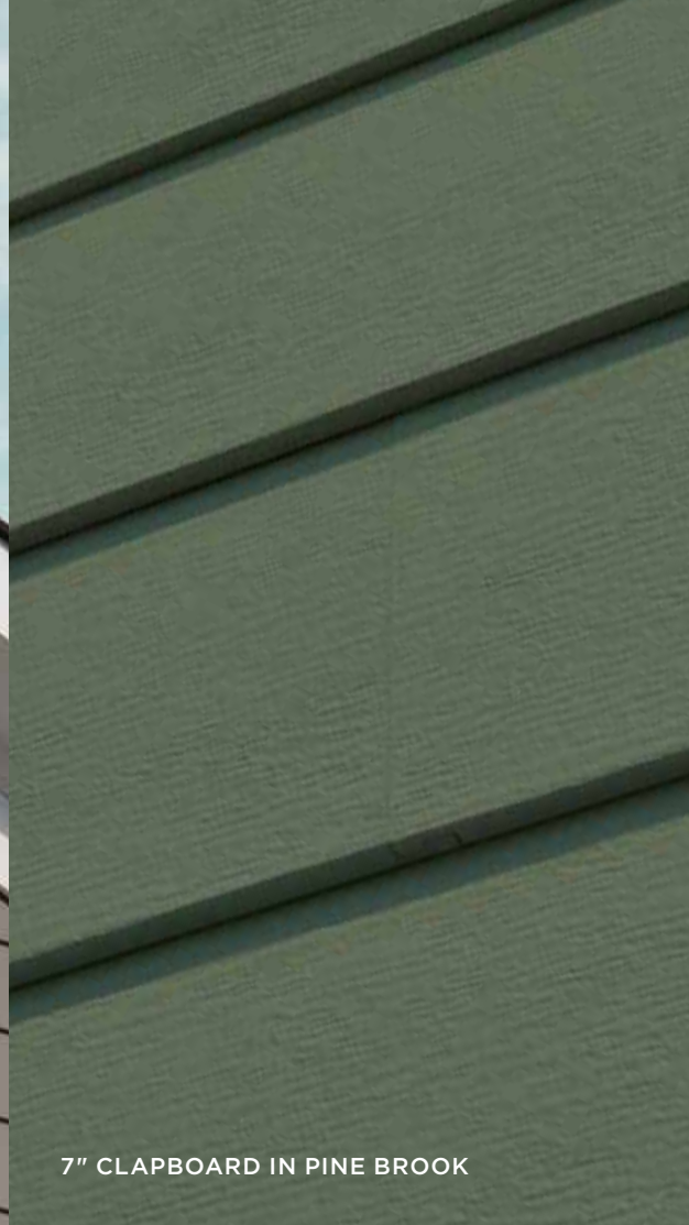
7" CLAPBOARD IN PINE BROOK