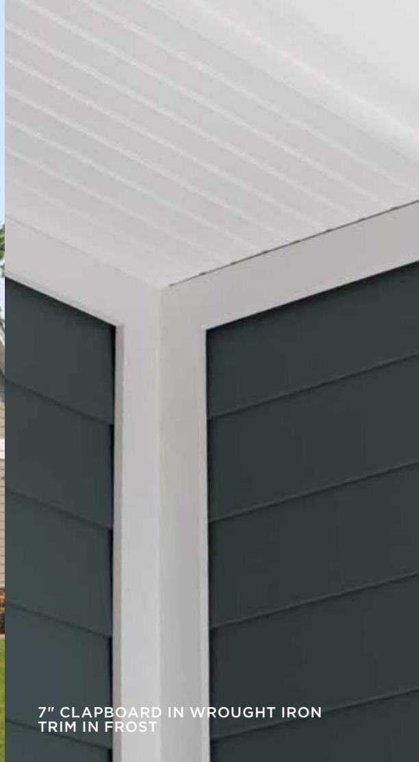
7" CLAPBOARD IN WROUGHT IRON TRIM IN FROST