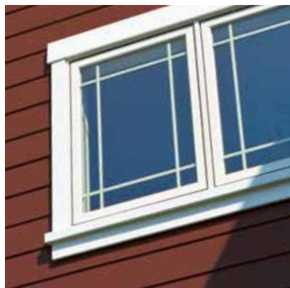
Window surrounds complete the curb-appealing picture.

They come in the same fade-resistant Kynar Aquatec-coated color palette as Select Siding. So they complement each other perfectly and have the same high aesthetic and low maintenance benefits.